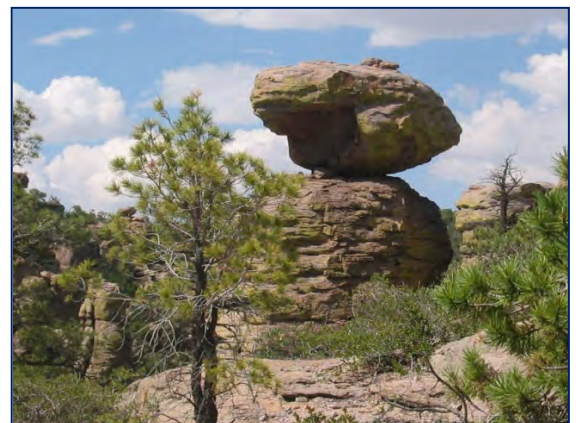
Chiricahua National Monument