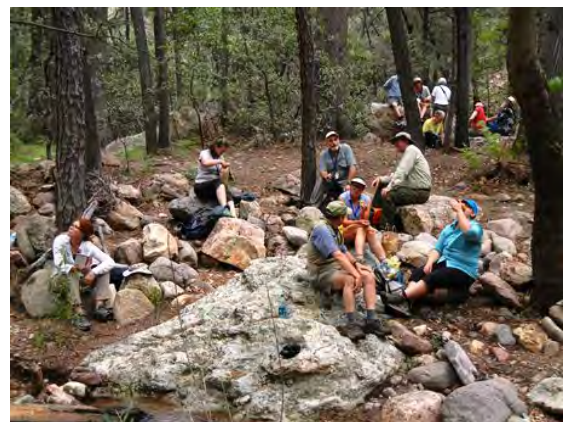
Resting after a long hike