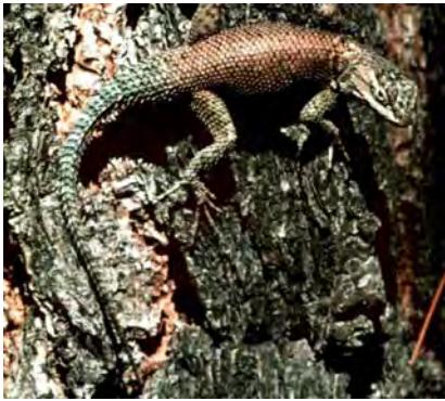
Yarrow's Spiny lizard

emergence from overwintering sites and the establishment of territories. Yarrow's spiny lizard ( Sceloporus jarrovii ), the focus of my research, is a bit of an anomaly