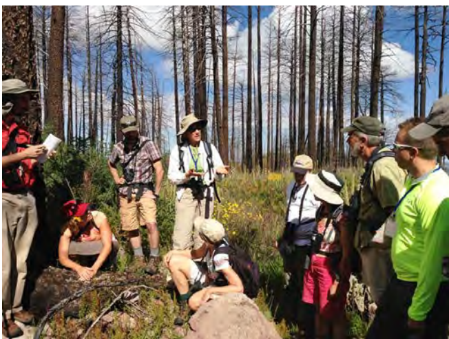
OBFS field trip to Rustler Park

In September 2013, the Southwestern Research Station was honored to host the Annual Meeting of the Organization of Biological Field Stations (OBFS). The theme for the meeting was “How Biodiversity is Shaping the Evolution of Research and Education at Field Stations”. The last time this meeting was hosted at the SWRS was in the early 1980’s. Since that meeting, the Station expanded its education and science facilities and built a new dormitory— so we were confident that we could provide meeting space, housing and food for the estimated 80-90 attendees predicted to register for the meeting. After filling every bed at the Station, several tents scattered