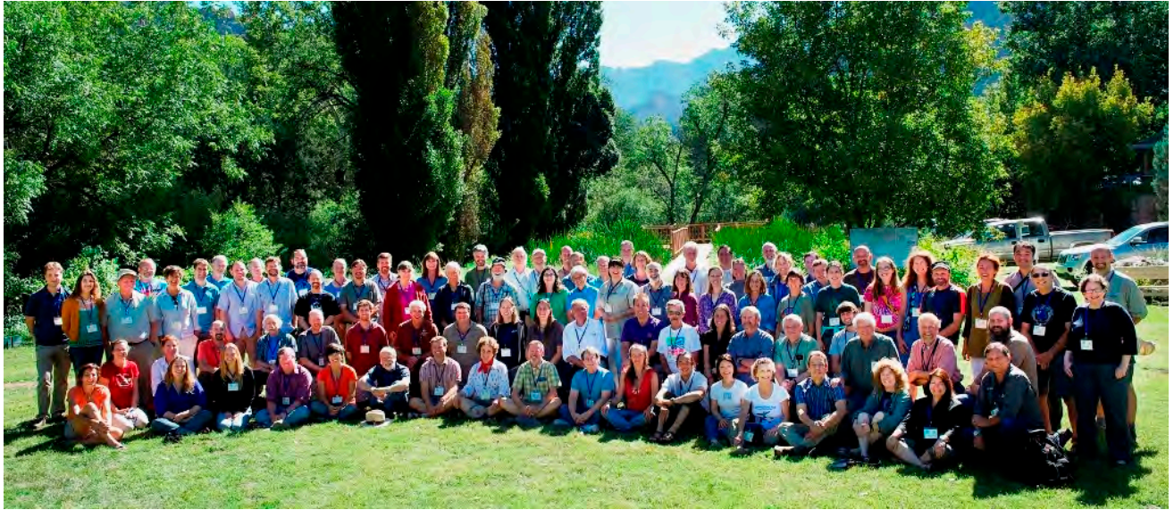
Representatives from biological field stations and marine labs from all over the world attend the meeting.

Enjoy some pictures from the 2013 Organization of Biological Field Stations Annual Meeting.