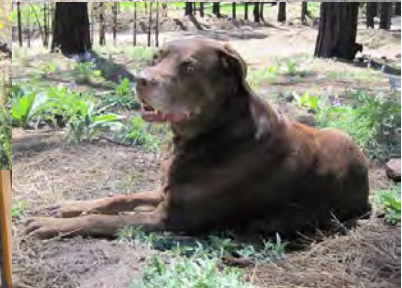
Some of P.D.'s past and current non-human friends.