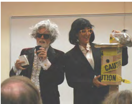
OBFS annual auction